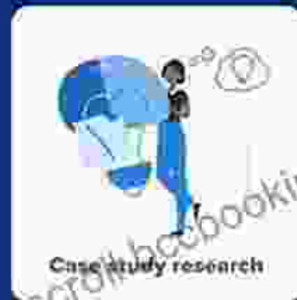
Case study research